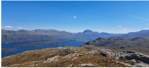
1 - Photo from Andy our CSO, in the Highlands.