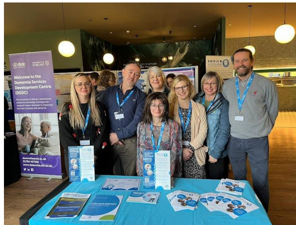
2 - The Team...